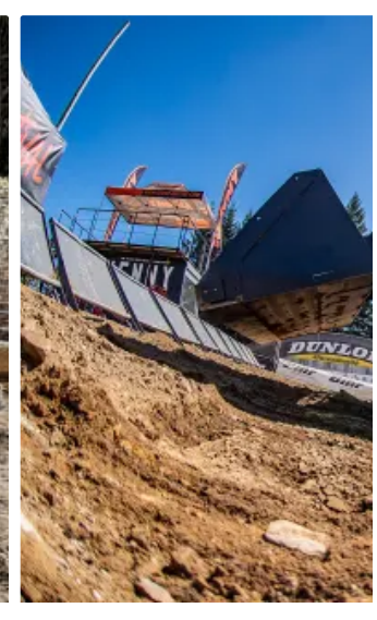
Bobcat Loaders Build Ra

Rome is a unique city in the world: it has buried under it an immense archaeological museum, the result of over 2800 years of history.