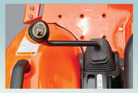
9x3 Manual Transmission

Manual transmission models feature 9 Forward and 3 Reverse speeds delivering heavy duty performance. Second and Reverse gears are synchronized for efficient forward and reverse operations requiring frequent shifting.