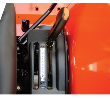
3-Point Control Lever The ergonomic 3-point control lever has smooth motion for reduced effort and improved control.