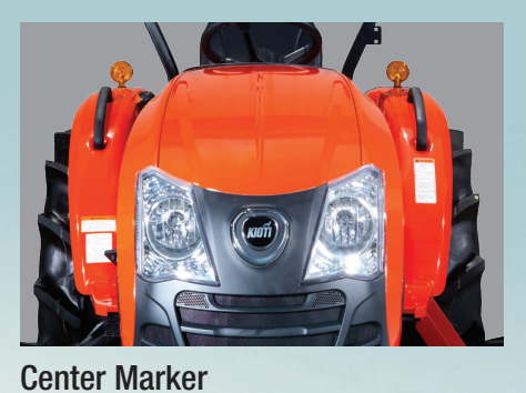
The center ridge marker on the hood assists with maintaining straight lines during operation.

Manual transmission models feature 9 Forward and 3 Reverse speeds delivering heavy duty performance. Second and Reverse gears are synchronized for efficient forward and reverse operations requiring frequent shifting.