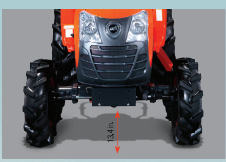
High Ground Clearance The minimum ground clearance of 13.4 in. provides sufficient clearance for use on rocky or uneven terrain.