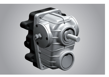
Powerful HST Transmission

HST models employ a two pedal system for forward and reverse with smooth engagement, acceleration and deceleration. Pedal pressure is minimized which reduces operator fatigue during long hours of use and when doing repetitive tasks.