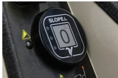
Digital Slope Gauge Recommended for operation on slopes.